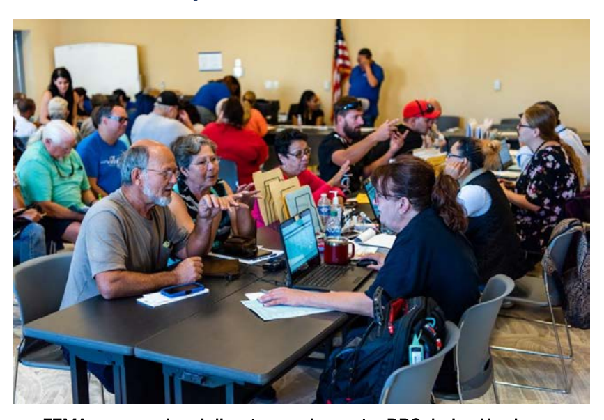
FEMA personnel and disaster survivors at a DRC during Hurricane Michael depicts limited potential for social distancing measures using standard facility footprints.

FEMA, in coordination with SLTT partners, will determine the use of Disaster Recovery Centers (DRC) or Disaster Survivor Assistance (DSA) teams phased according to the reopening of an impacted area. In areas with limited field presence, FEMA will use online and phone registration and virtual assessments to ensure program delivery. If phone lines are down, FEMA will prioritize stabilizing the communication lifeline in order to restore networks and support registration processes. FEMA will also coordinate with federal and voluntary agency partners