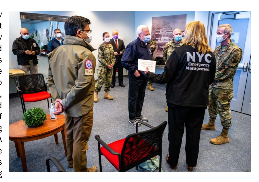
FEMA Leaders and Staff Coordinating with New York City and Department of Defense Personnel on May 7, 2020.

The Nation's emergency management system is most successful when it is locally executed, state managed, and federally supported. Jurisdictions the country across responsible for leading efforts to stabilize community lifelines, distributing commodities and resources to meet the needs of an emergency, and supporting program delivery. FEMA continues to support these efforts. Emergency managers should begin reviewing existing response plans and guidance to align, link, and synchronize community response actions with