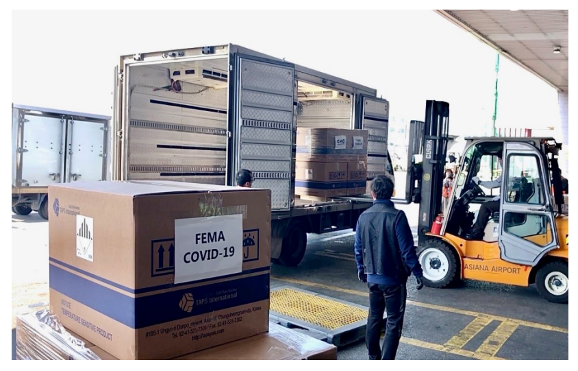
FEMA Logistics Staff coordinate the transportation of COVID-19 test kits arriving through Project Airbridge on April 14, 2020.

FEMA continues to ensure Distribution Centers maintain